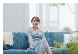
Self-management of health

Radiate radio waves in your own direction Measure yourself