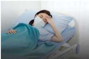
Home care monitor