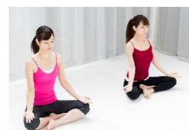
Heart rate / respiration rate monitor during exercise