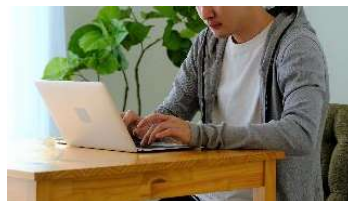
Health management of home workers