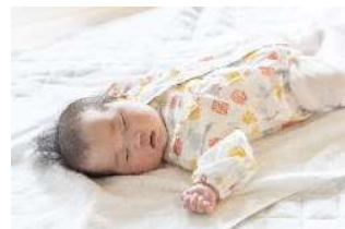
Infant status monitor